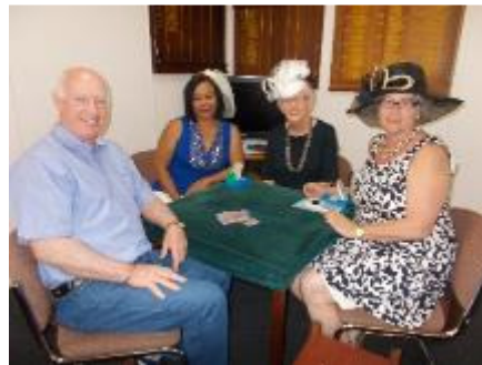
From around the room!