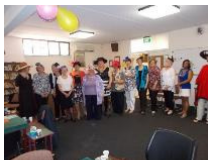
Some of the beautiful hats