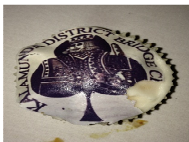
One of the beautiful cupcakes